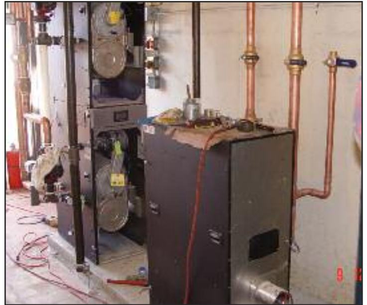
The newly installed gas heating system in the Church

To learn more about the Campaign and the state of OLQM's financial affairs, please refer to the Parish Financial Report for the fiscal year ending 8/31/11, which is included here.