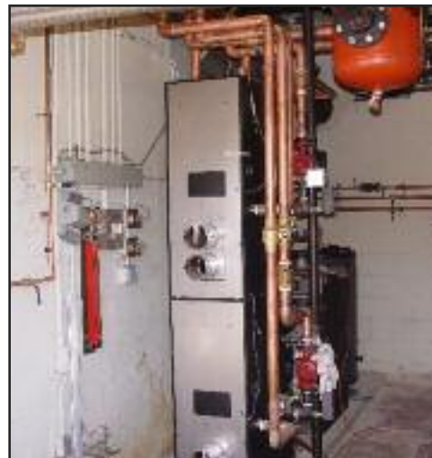
The newly installed gas heating system in the Church