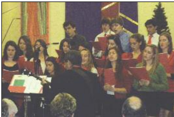
The Teen Choir performs at the Annual Christmas Concert