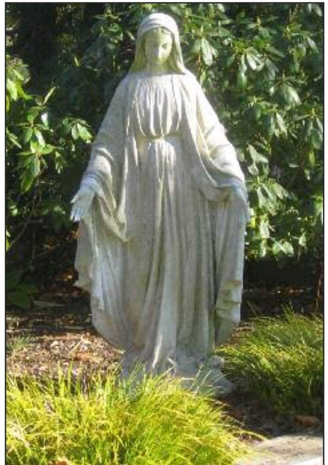
Spend a peaceful and reflective moment at the statue of the Blessed Mother