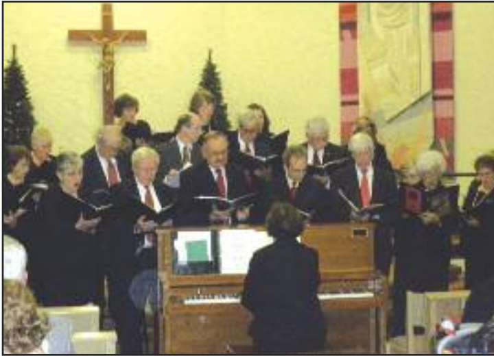
The Adult Choir, lifting their voices in song at the Annual Christmas Concert